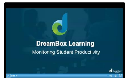
Video: Monitoring Student Productivity