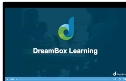
Video: What is DreamBox?