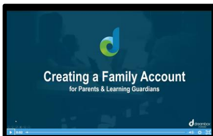
Video: Creating a Family Account