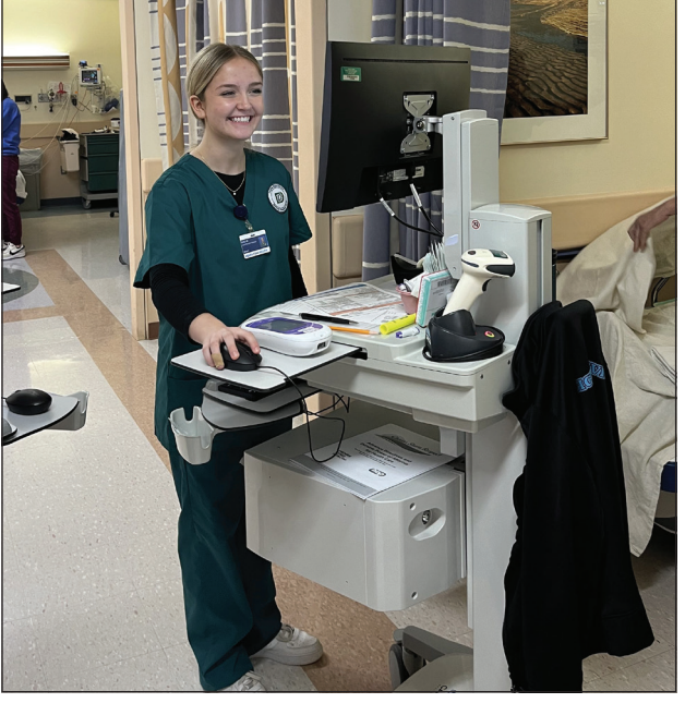
The program emphasizes health care skills. This student is monitoring vital signs and entering them in the patient's

Anchor Bay Schools Armada Area Schools Center Line Public Schools Chippewa Valley Schools Clintondale Community Schools Eastpointe Community Schools Fitzgerald Public Schools Fraser Public Schools Lake Shore Public Schools Lakeview Public Schools L'Anse Creuse Public Schools Mount Clemens Community Schools New Haven Community Schools