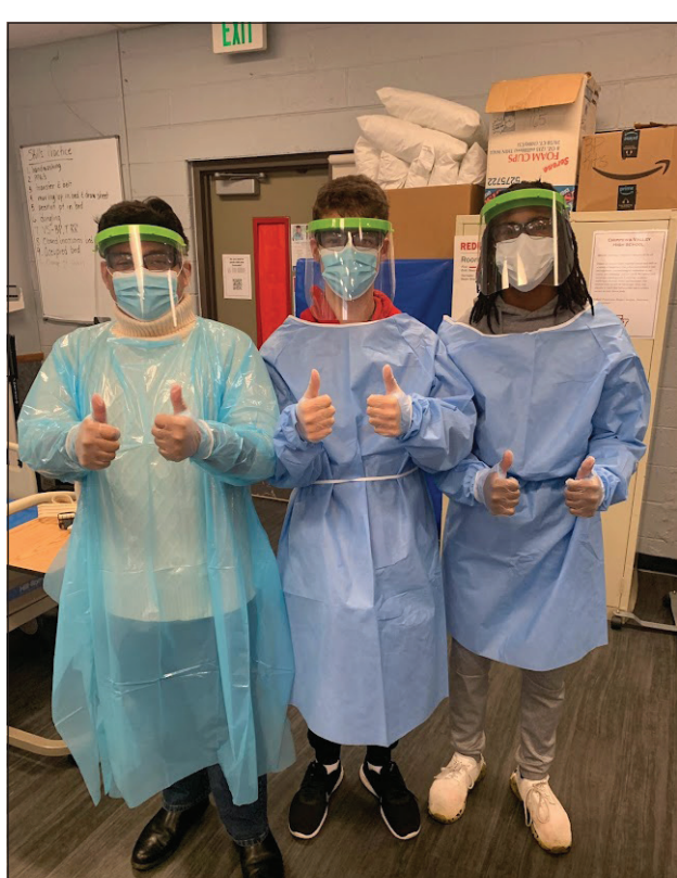
Students wearing gowns, gloves and face shields commonly referred to as personal protection equipment in the healthcare field.

cal community. By combining hands-on learning environment taught by instructors whose resumes are filled with industry experience, and with support from industry advisory panels that help instructors tailor curriculum and guide lesson planning, students are provided with real world learning in a real-world work environment. What better way to get a jump on this highwage, high-demand career