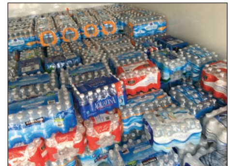
Shawnee Elementary Water Drive